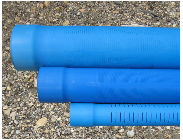
Pic. 2 Section image of cuts made on three and four sides